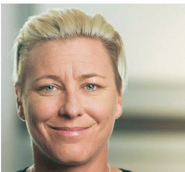
Abby Wambach Retired, U.S. Soccer Team Captain