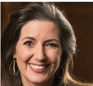
Libby Schaaf Mayor of Oakland, CA